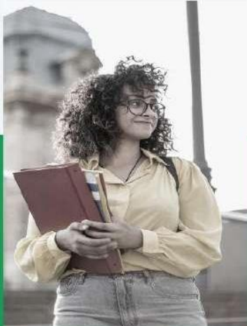
Seth Gyaniram Bansidhar Podar College, Nawalgarh