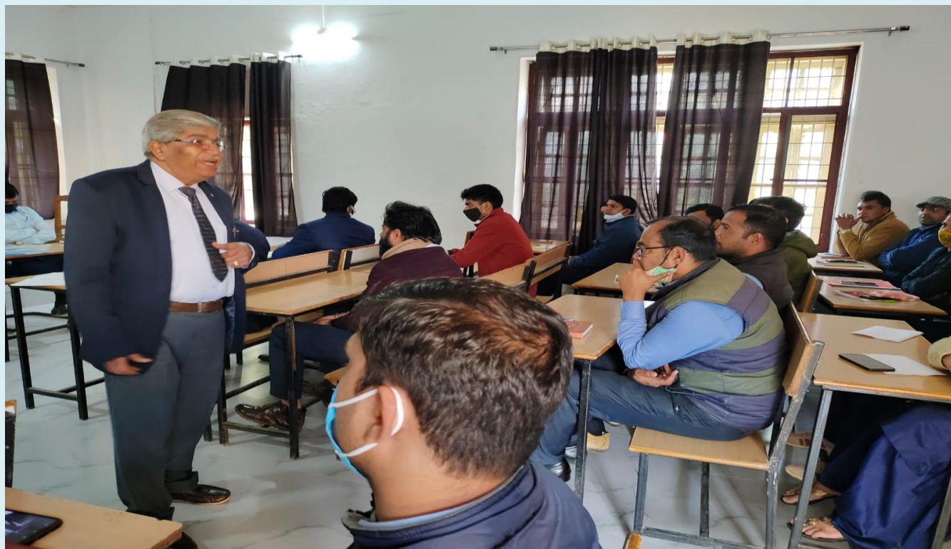
FDP Interdisciplinary On Communication Skills and Linguistics