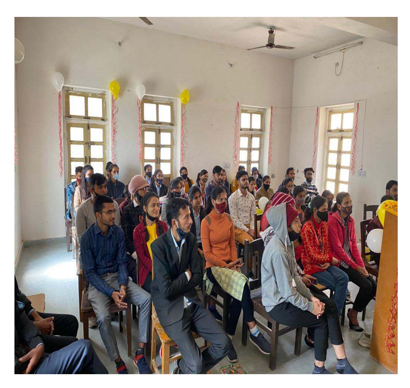
Students sitting on the occasion of Basant Panchami