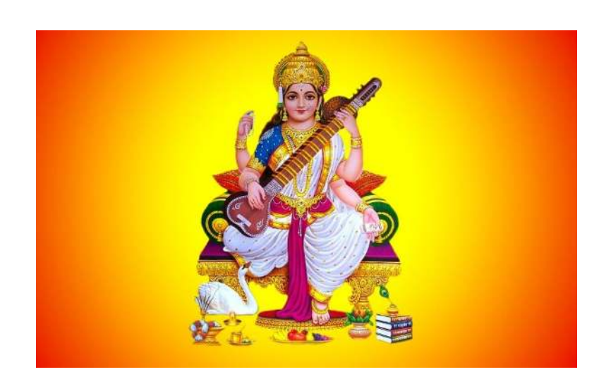
Organized by Students of M.Sc. and B.Sc. on February 5, 2022