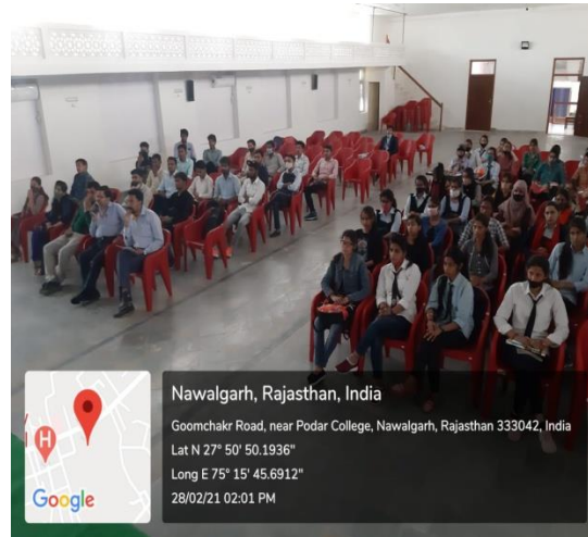
Figure 2: Participating students in oral presentation