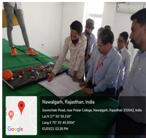
Figure 3: Inspection of Charts By Principal