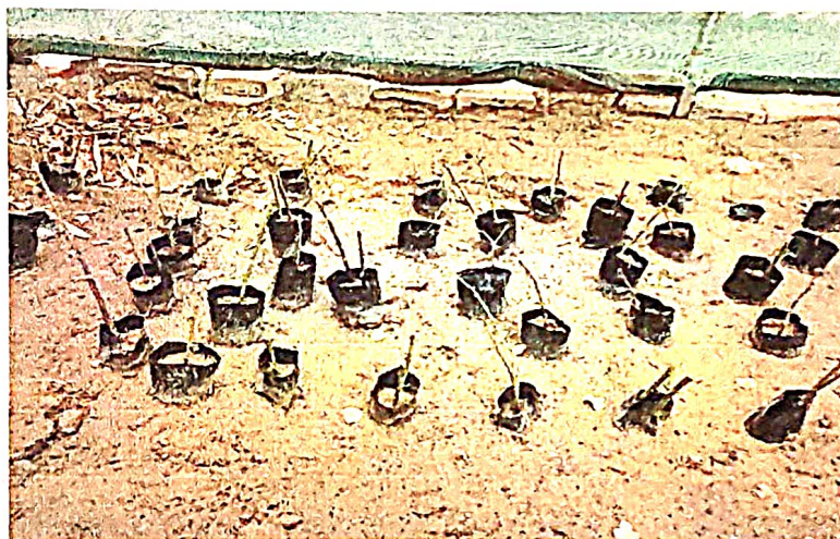
Propagation by stem Cutting