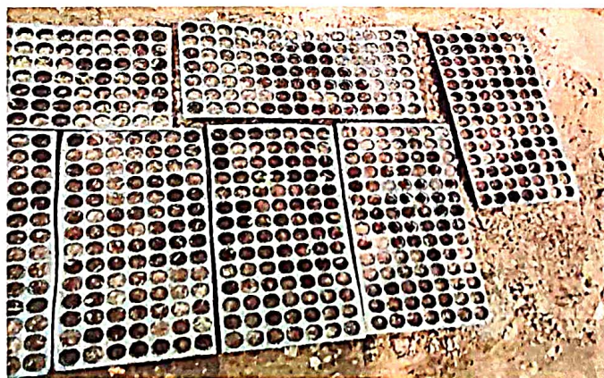
Development of Plants by Seeds

Principal Seth G.B. Podar College Nawalgarh - 300042