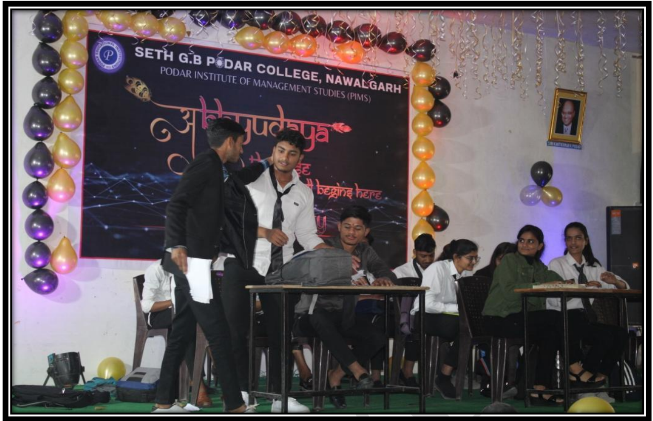
Drama act Presented by the Students