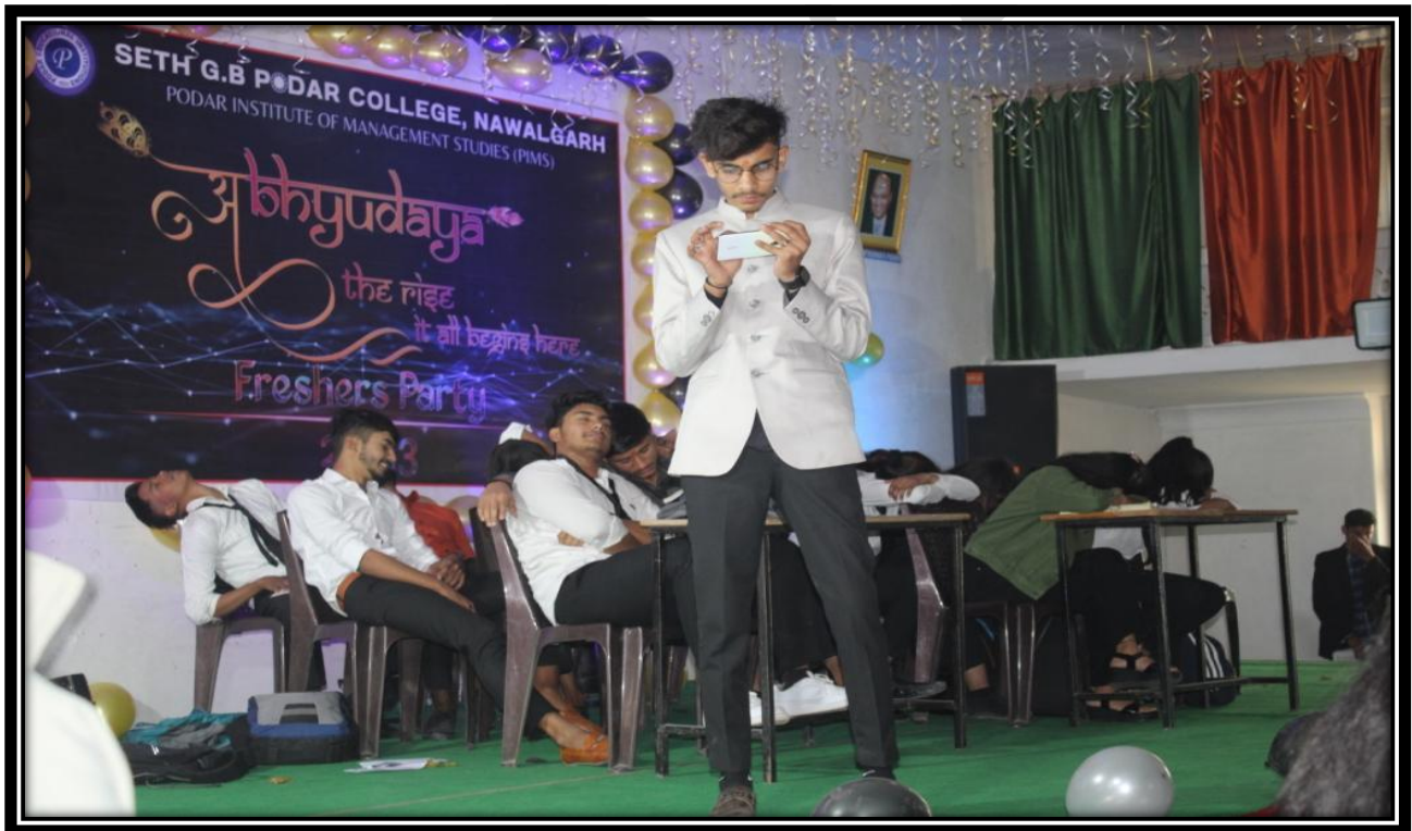
Drama act Presented by the Students