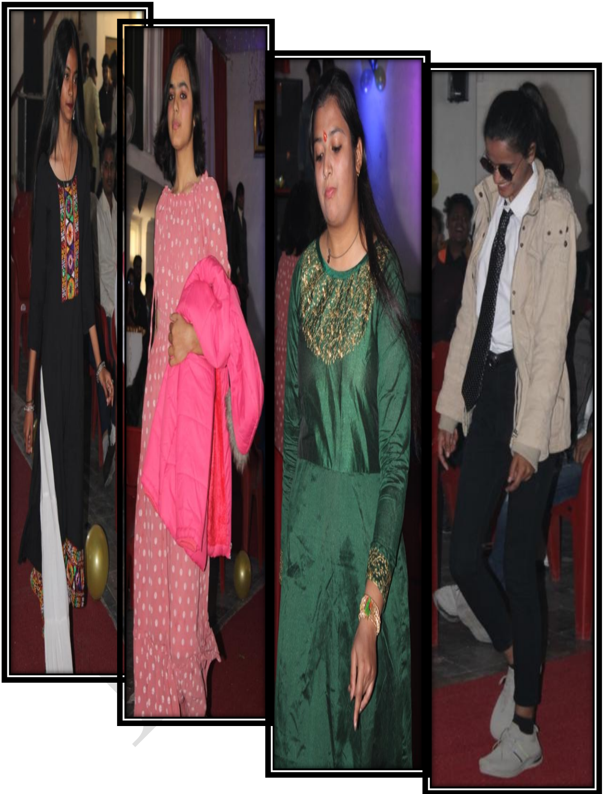
Ramp walk by Girls