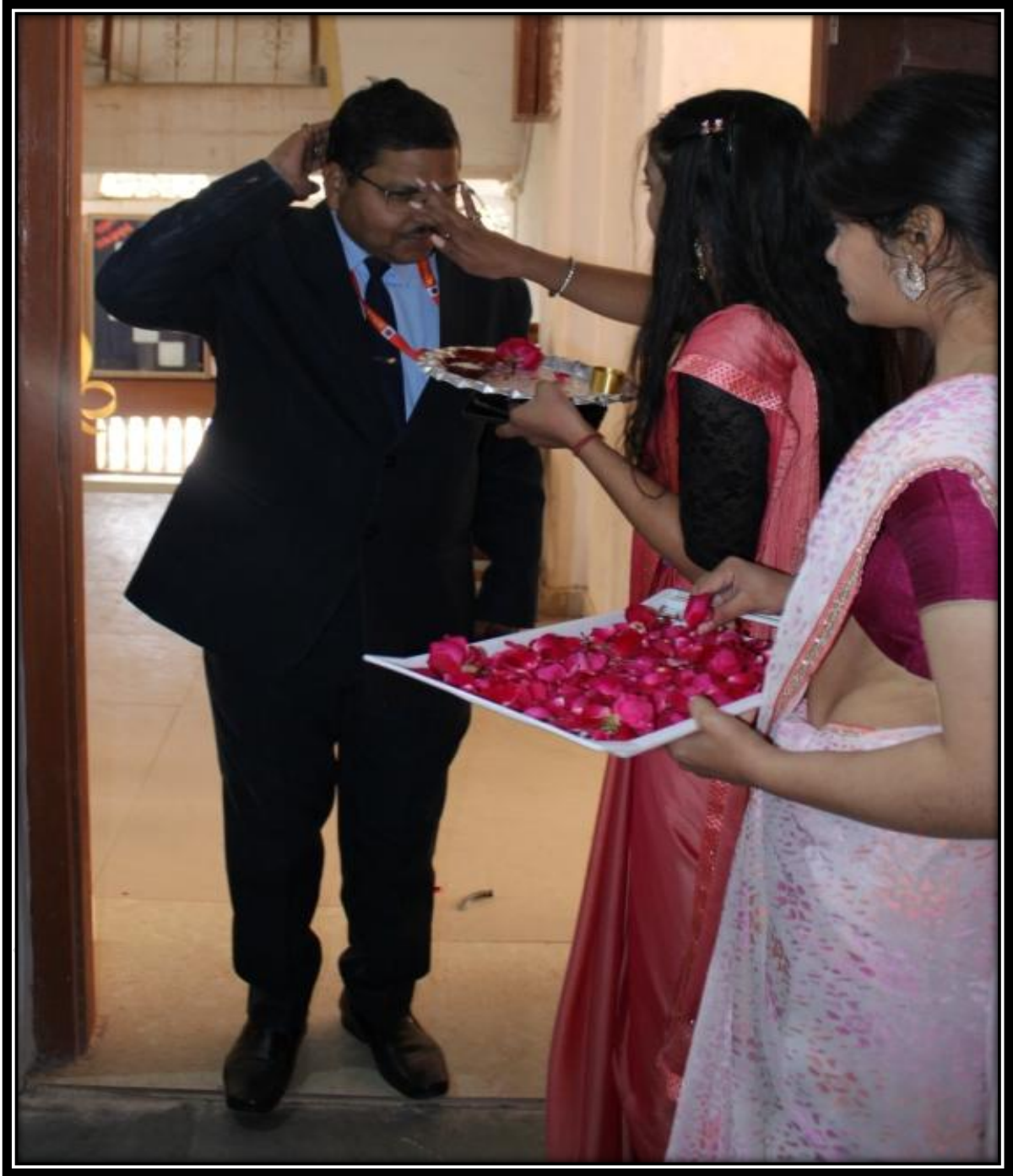
Welcome Tilak of Principal Sir by Students