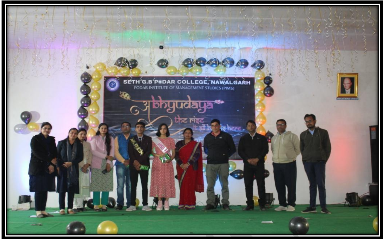
Staff Members and Jury with Selected Mr. and Ms. Fresher 2022-23