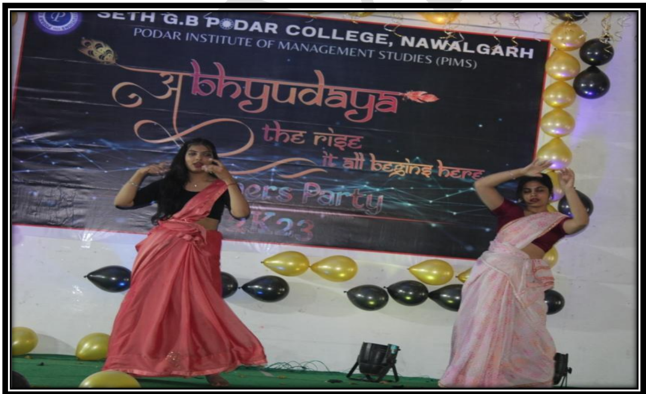
Dance by the Girls Student