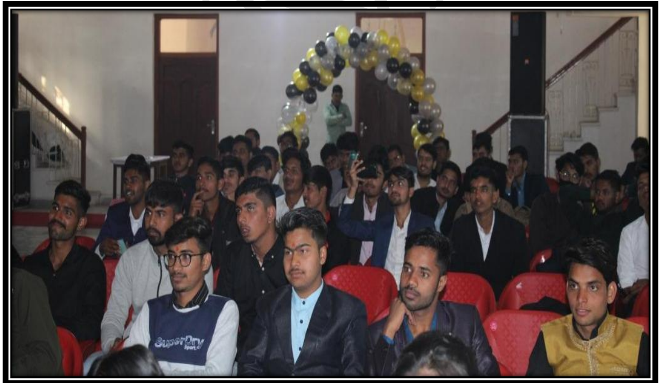
Freshers at the Programme