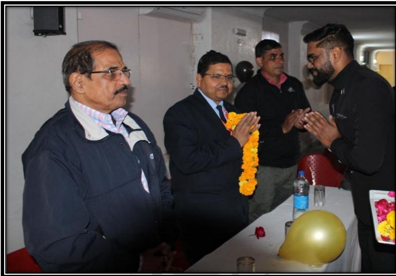
Garlanding to Principal Sir