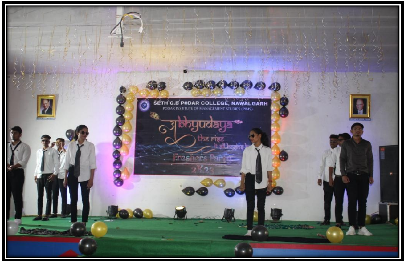
Group Dance by the Students