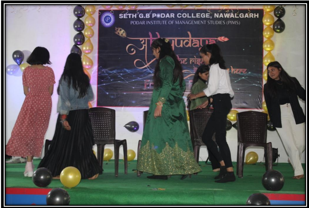
Students participating in Musical Chair