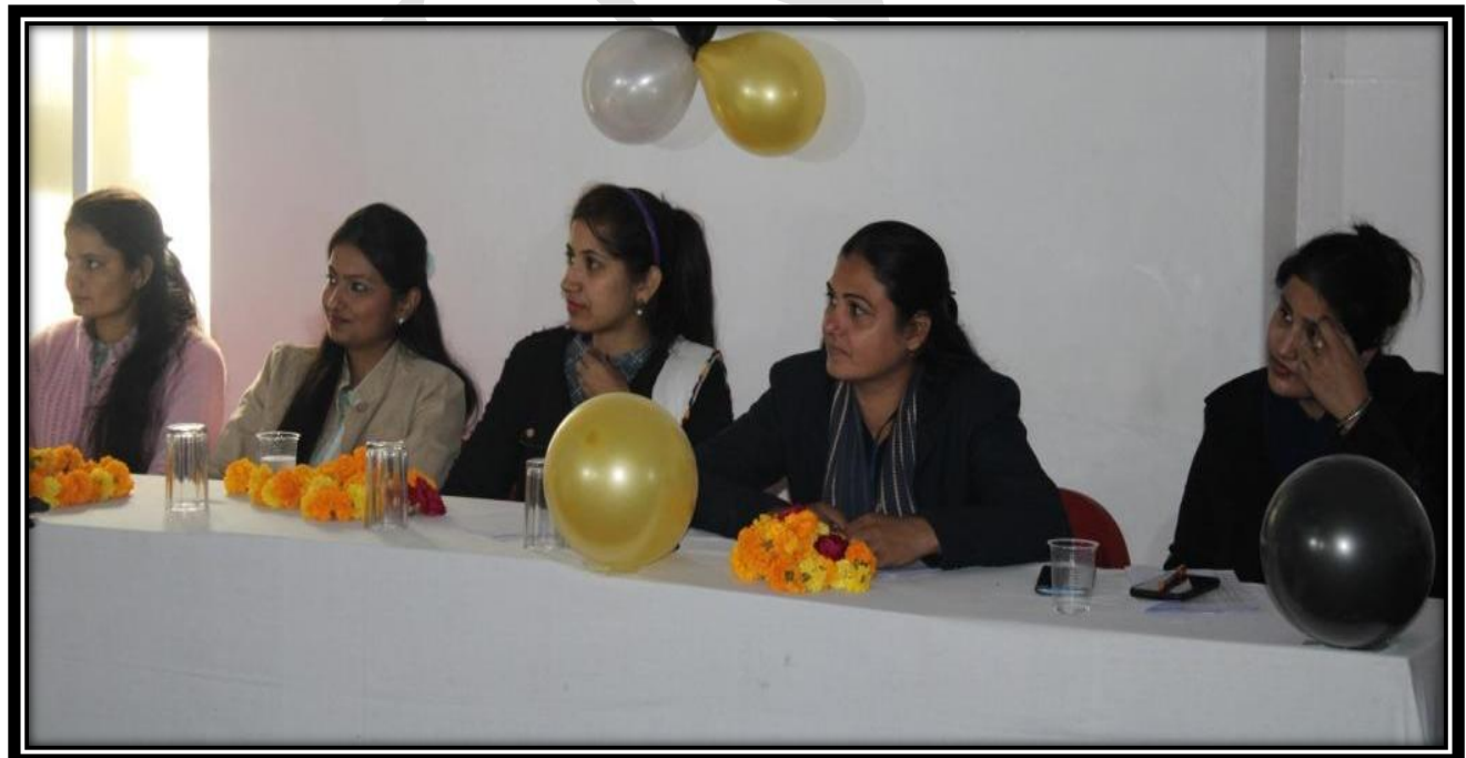
Programme judge by the jury