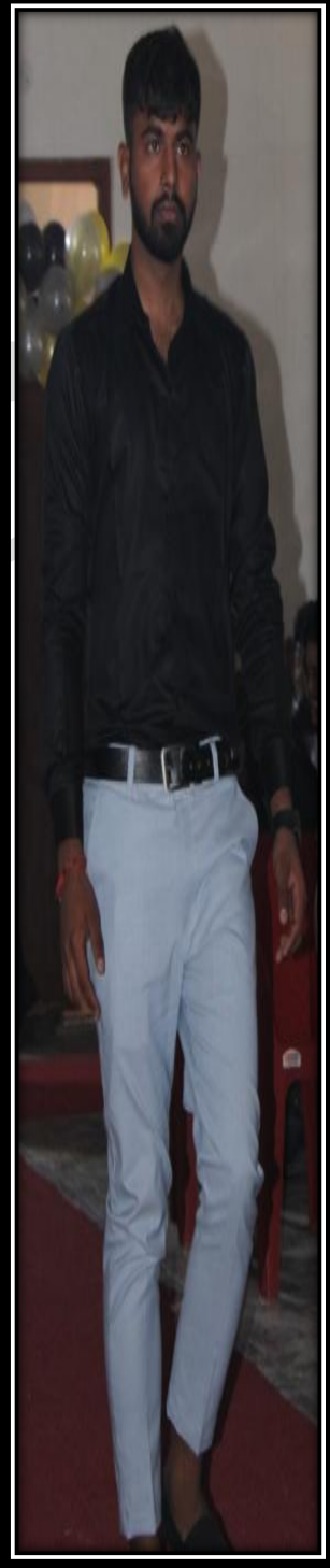
Ramp walk by Boys