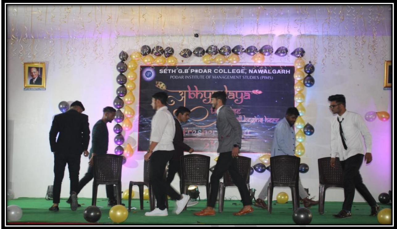
Students participating in Musical Chair