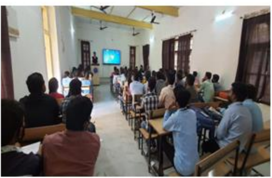
Students present in Research Methodology