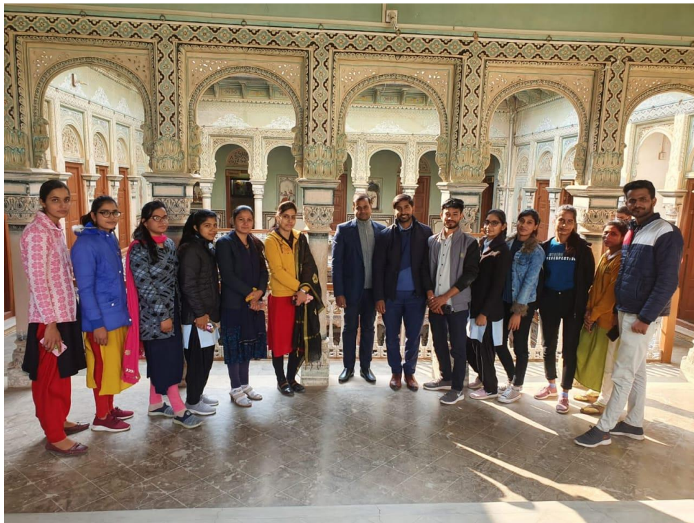
Visit to Havelis