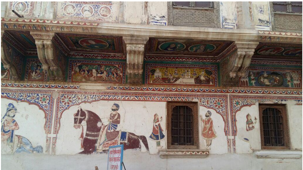
Beautiful painted outer wall of Haveli