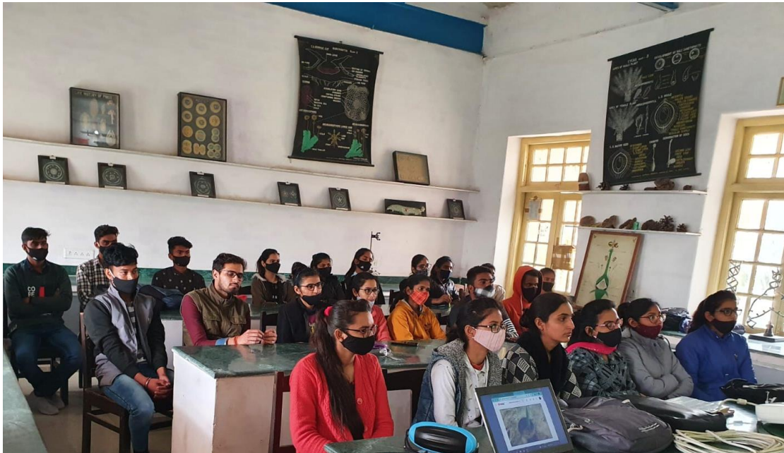
Participants during the session