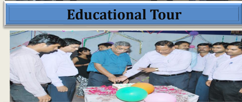
Mathematics Day Celebration