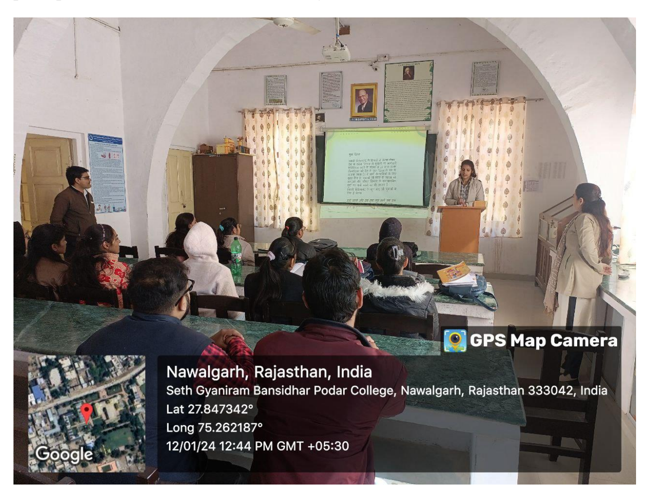
Students of M.Sc. Botany were present power point presentation

In the program total 22 students participated and know about the National Youth Day and its important. On this day students of M.Sc. Botany were present power point presentation on National Youth Day.